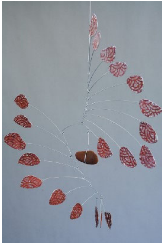
ABOVE: Angophora 4 , 2007 Galvanized steel wire, paper, gouache, red ochre stone (from Mallacoota) Approx. 40cm high x 30cm wide x 30cm deep