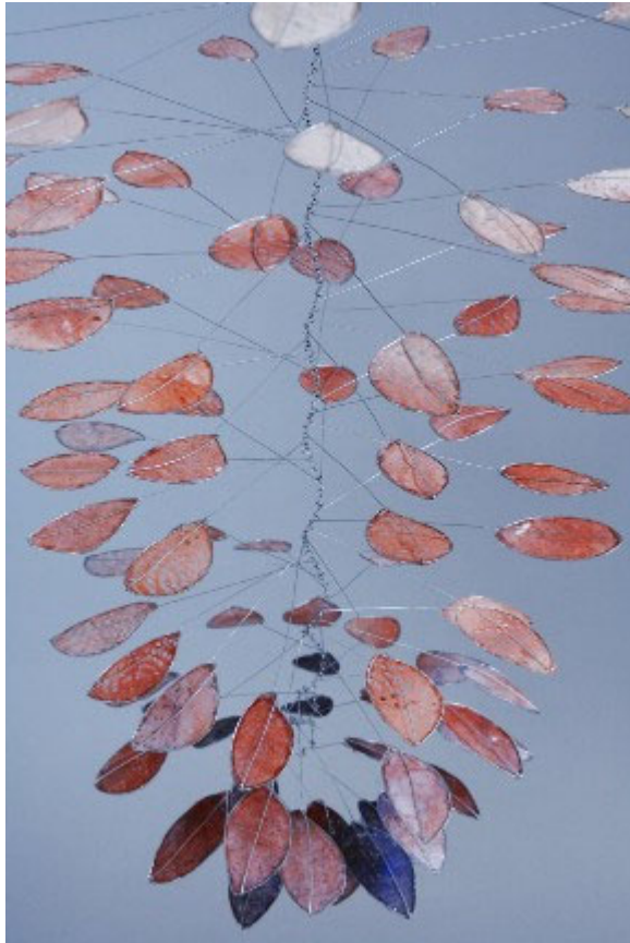
ABOVE: Angophora 1 (detail), 2007 Galvanized steel wire, paper, gouache Approx. 1.5m high x 50cm wide x 50cm deep. To view a selection of available mobile sculptures by Jade Oakley CLICK HERE .

Townsend Art Consulting APRIL 08 E-NEWSLETTER