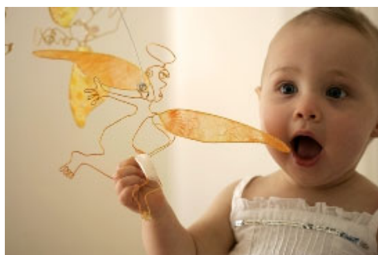
ABOVE: Angel Tree (detail) , 2008 Painted galvanized steel wire, paper, gouache. 4 mobiles each approx. 40cm high x 50cm wide x 50cm deep. Commissioned for Sydney Children's Hospital, Randwick

NEWSLETTER HEADER IMAGE: Detail of Commission for Stockland by Andy Scott, 2007 (Scotland)