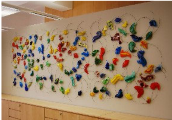
Vibrant New Sculpture by Virginia Reid

The Jewelled Net by Virginia Reid. Glass & Wire 4m x 1.2m. Commissioned to form part of an emerging artist collection for a Flinders Lane office in Melbourne's CBD. Installed March 08.